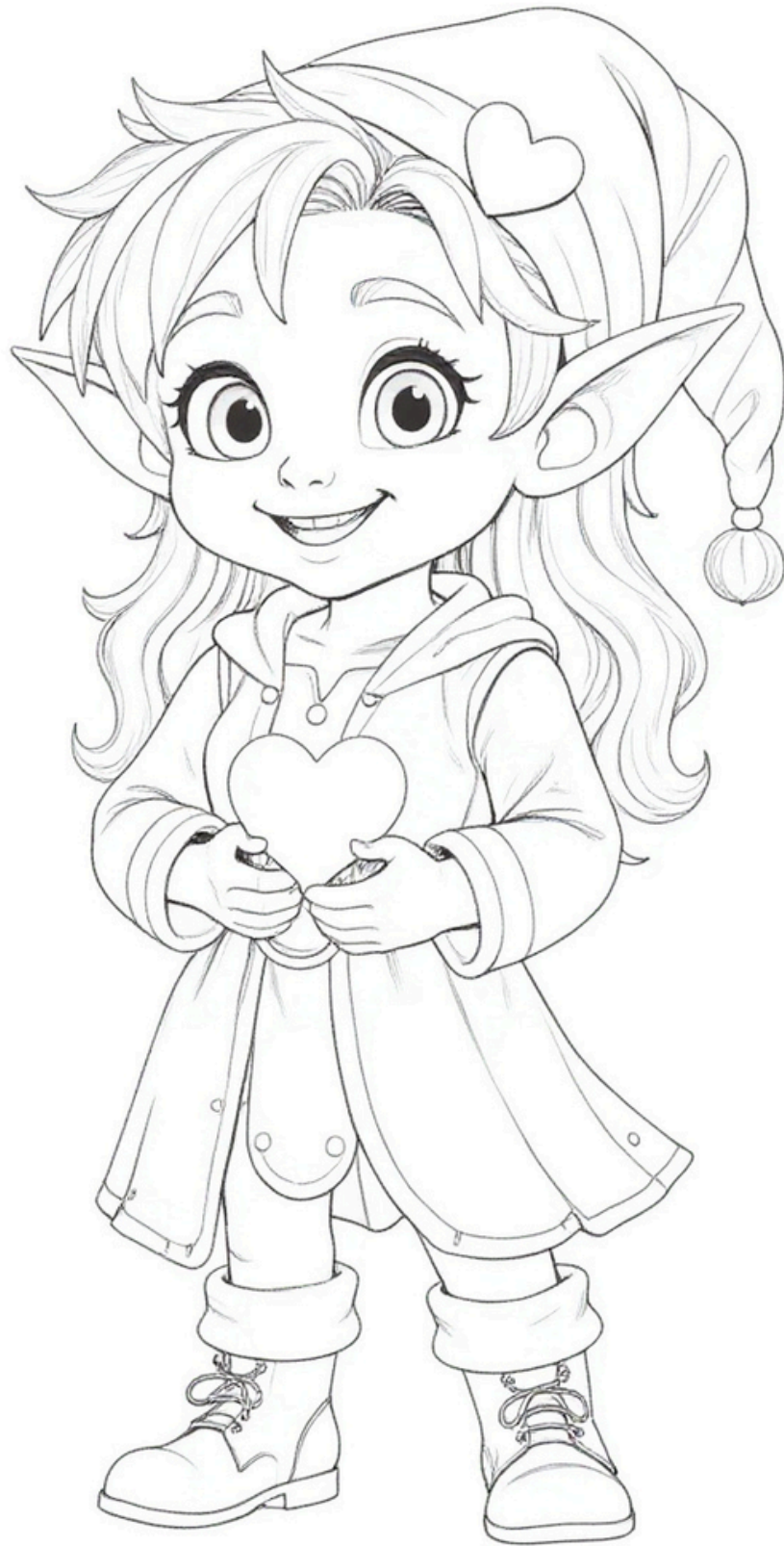
Amara- the Love Elf